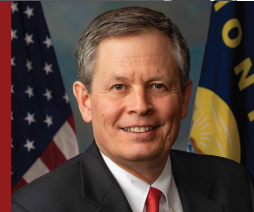
STEVE DAINES R